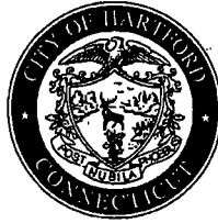
EDDIE A. PEREZ MAYOR