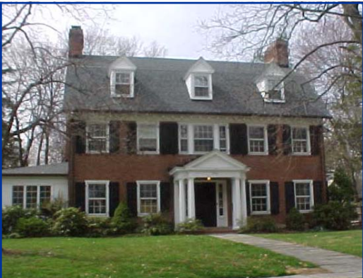
Colonial Revival– Kenyon Street