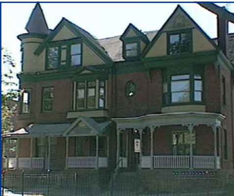
Queen Anne– Wethersfield Avenue