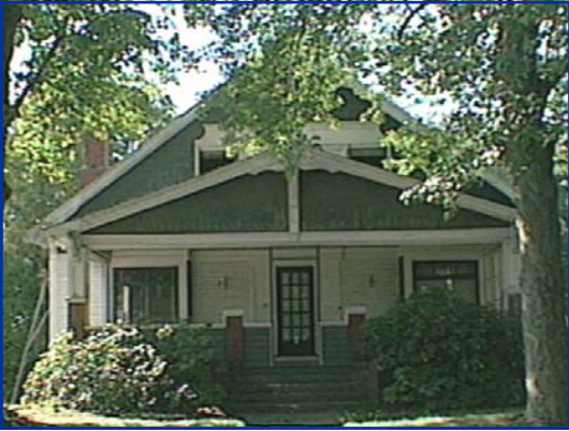
Bungalow (Arts and Crafts) – Fairfield Avenue