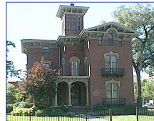
Italian Villa—Wethersfield Avenue