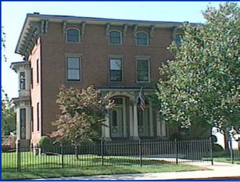
Italianate– Wethersfield Avenue