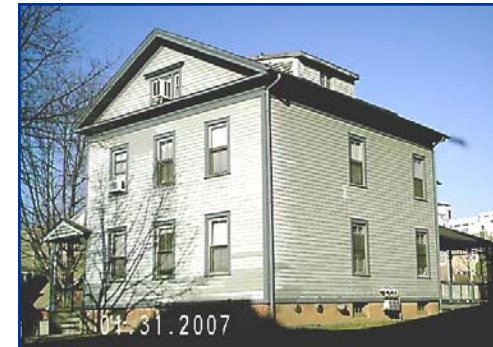
Greek Revival– Alden Street