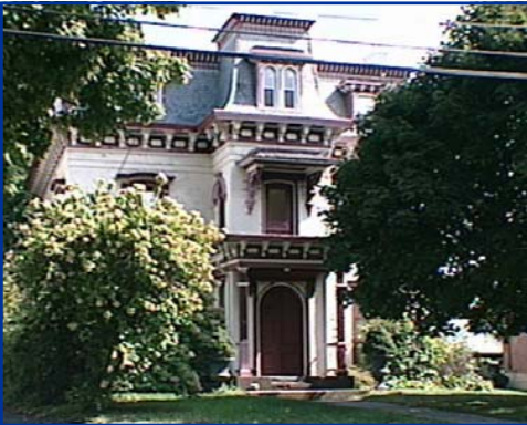
Second Empire– Fairfield Avenue