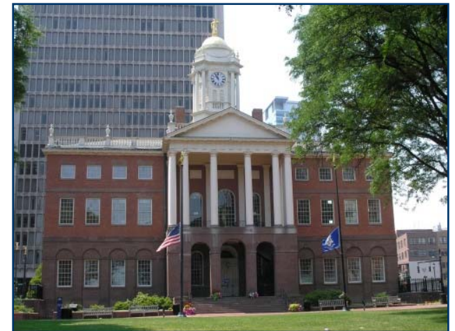
Old State House