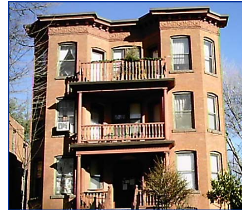
Perfect 6—Park Terrace