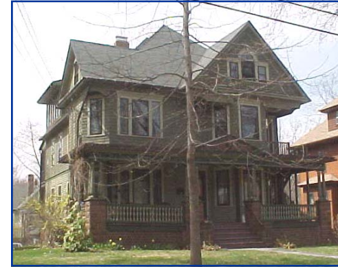
Neo-Classical Revival– Kenyon Street