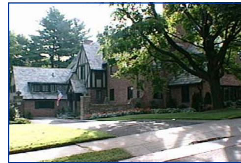
Tudor Revival– Prospect Avenue