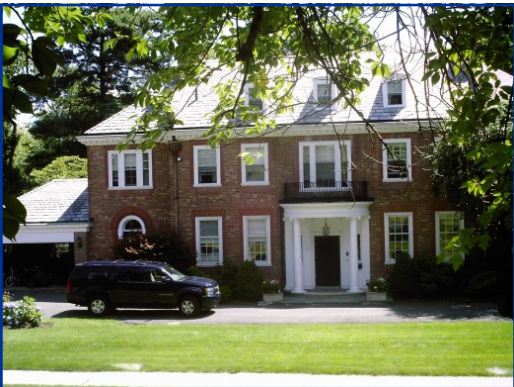
Georgian Revival– Westerly Terrace

Georgian Revivals, Tutor, Dutch Colonial and Colonial styles of housing are found in the Blue Hills neighborhood.