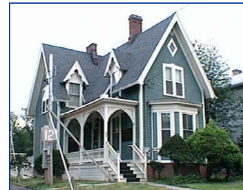
Gothic Revival– Allen Place