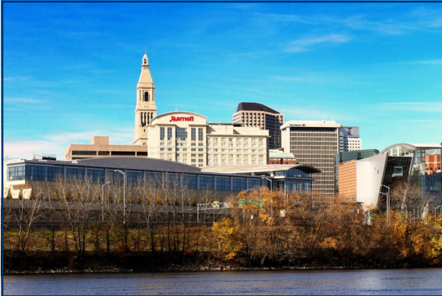
The Hartford Riverfront