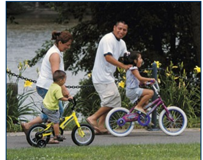
Charter Oak Landing