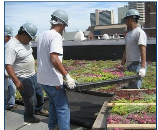
Installation of a Green Roof at the Betty Ruth and Milton B. Hollander Foundation Center