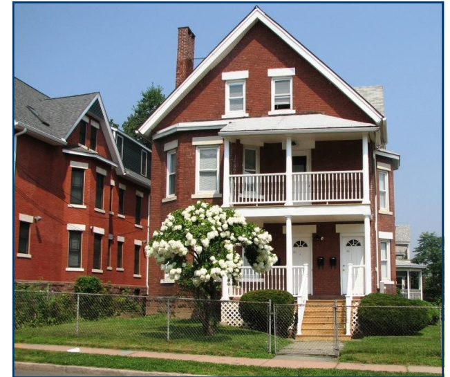
A house located on Allen Place

In order to achieve livable, sustainable neighborhoods, diverse sectors must work together. For example, the quality of schools is connected to the quality of housing, which is affected by the quality of transportation options, etc. Activities in these and other areas can have positive effects on the livability and sustainability of Hartford’s neighborhoods.