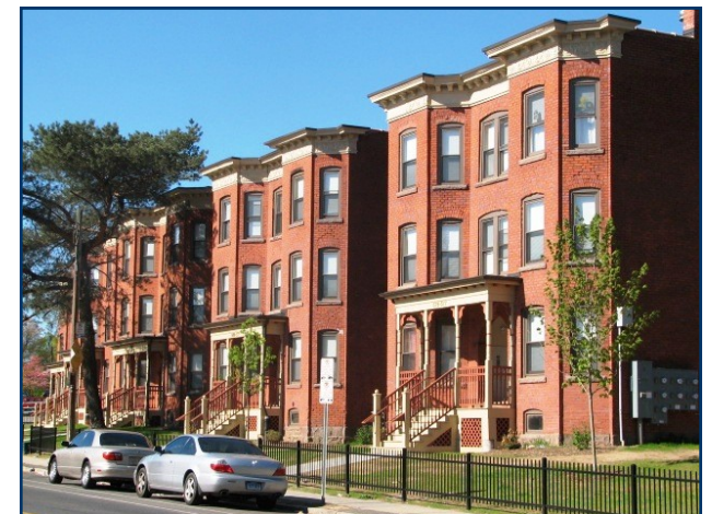
Frog Hollow Perfect 6's