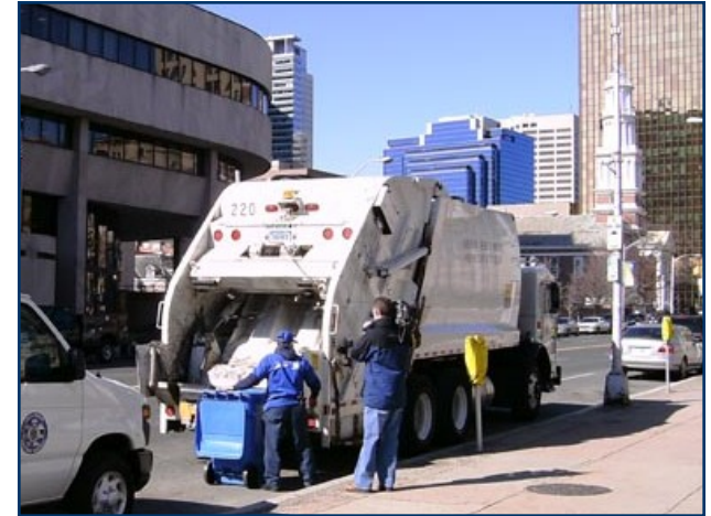
Single-stream recycling Downtown