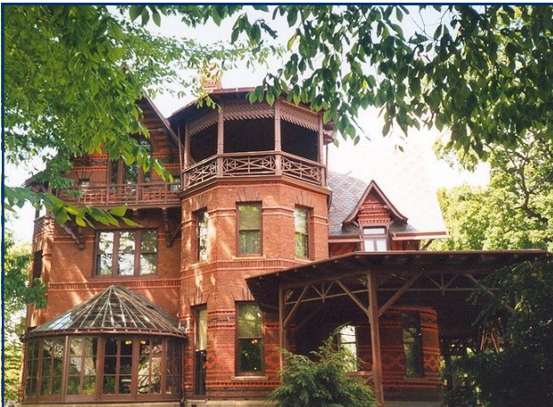
The Mark Twain House