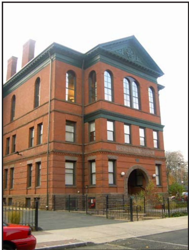
The Lyceum on Lawrence Street.

The Target Area contains two public elementary schools, Maria C. Colon Sanchez School on Babcock Street, and Dominick F. Burns School on Putnam Street. The area’s only appreciable open space is the 2.8-acre Pope Park North, affectionately known as Baby Pope, which faces Russ Street between Putnam Street and Park Terrace.