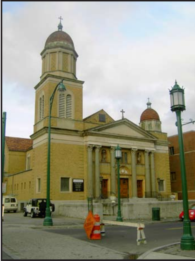
St. Anne's Church