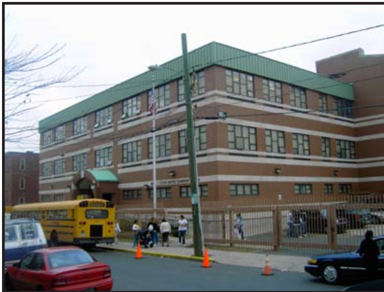
Maria C. Colon Sanchez School on Babcock Street

The Center for Community at Billings Forge is expected to open soon. The Center will contain a technology lab with 16 computer terminals and adjacent classroom/community space, and will focus on technology-centered year-round programming for middle school students. Next year, the Center is expected to begin a program that will provide employment opportunities for High School students.