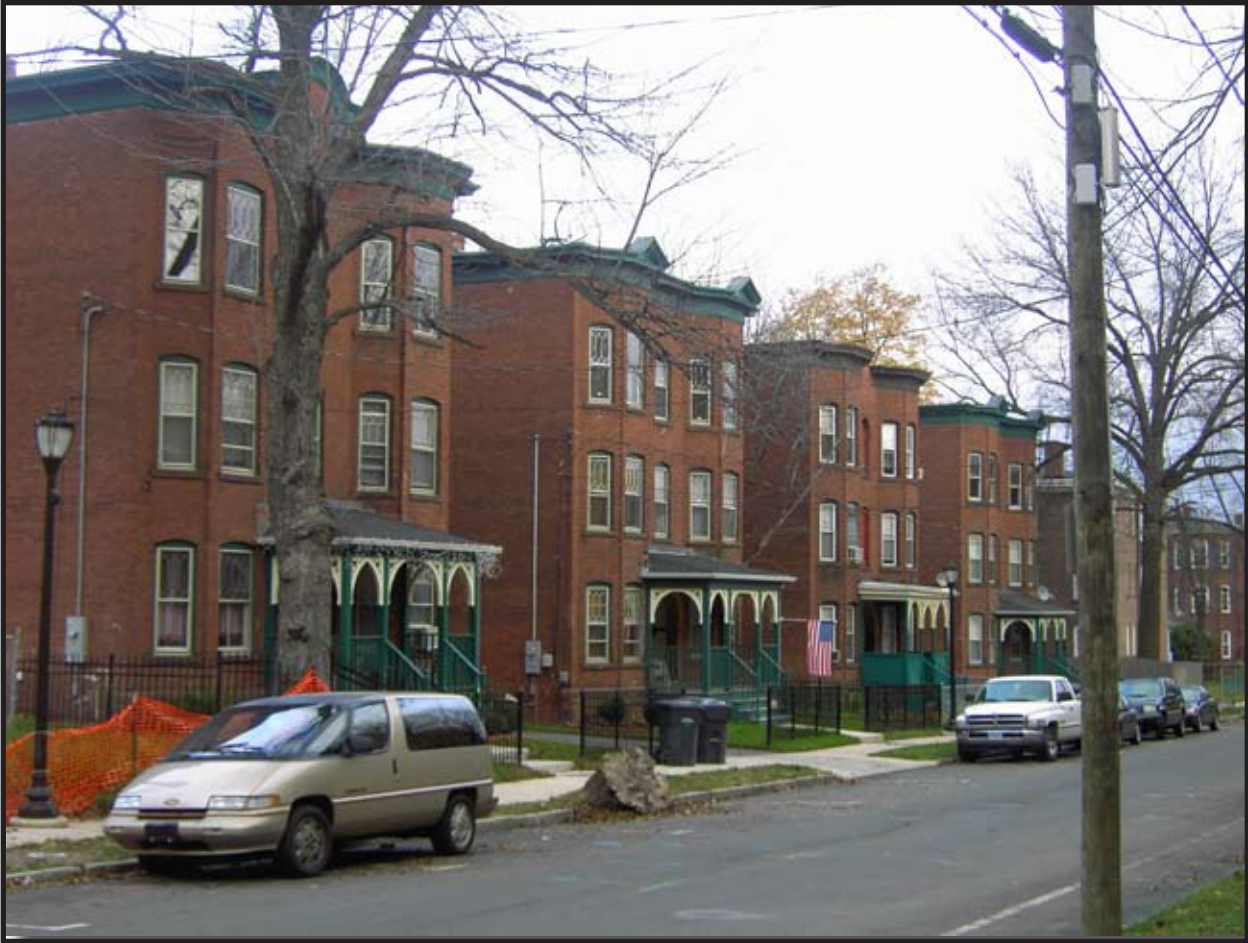
A row of “Perfect Sixes” on Putnam Heights that were part of the Mortson/Punam Heights Project

More recently, the City’s Department of Housing and Community Development undertook a major rehabilitation/new construction project that spanned Mortson Street, Putnam Heights, and Park Terrace, an area, with numerous “perfect six” brick structures built in the early 20th century.