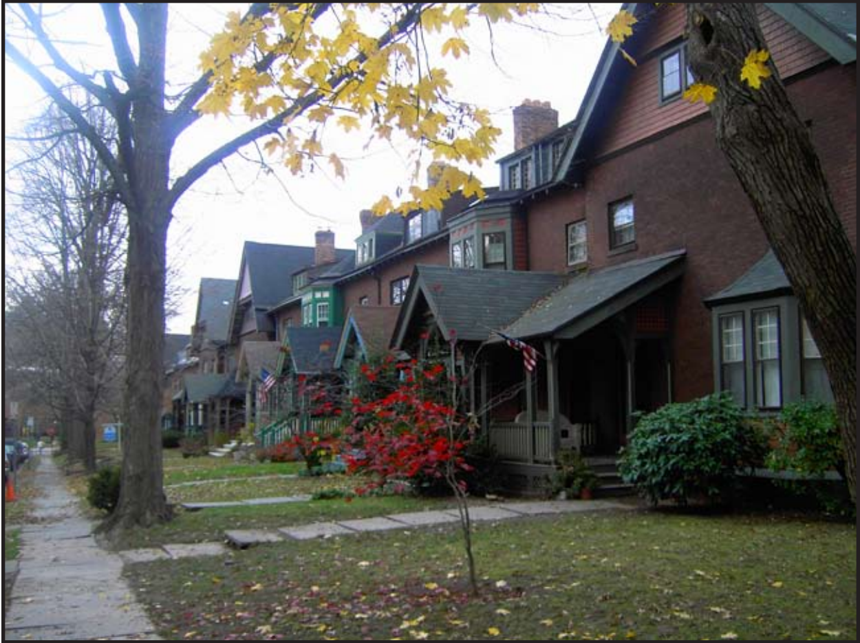
One of Hartford's only blocks of row houses, along Columbia Street.