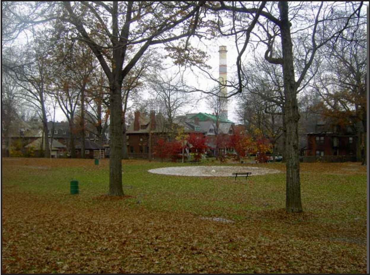
A view of Pope Park North

HPD handles calls and what to expect when making a call, including when to use 911, and how to follow up with complaints. Block watches are also an effective means of community building. Simply getting to know your neighbors and who lives where makes for a safer neighborhood. 2. Current efforts to increase police presence and improve response time are vital. Meetings between residents and appropriate police officials to continue to work on the issue are viewed positively. 3. Residents are requesting foot patrols and bicycle patrols. 4. Baby Pope Park is a key public space in the Target Area, and residents believe public safety in the park is critical.