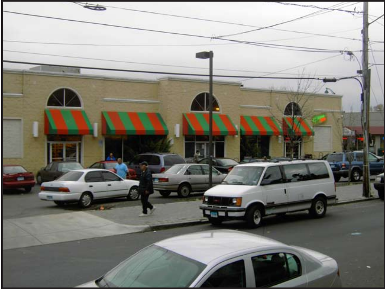
El Mercado on Park Street