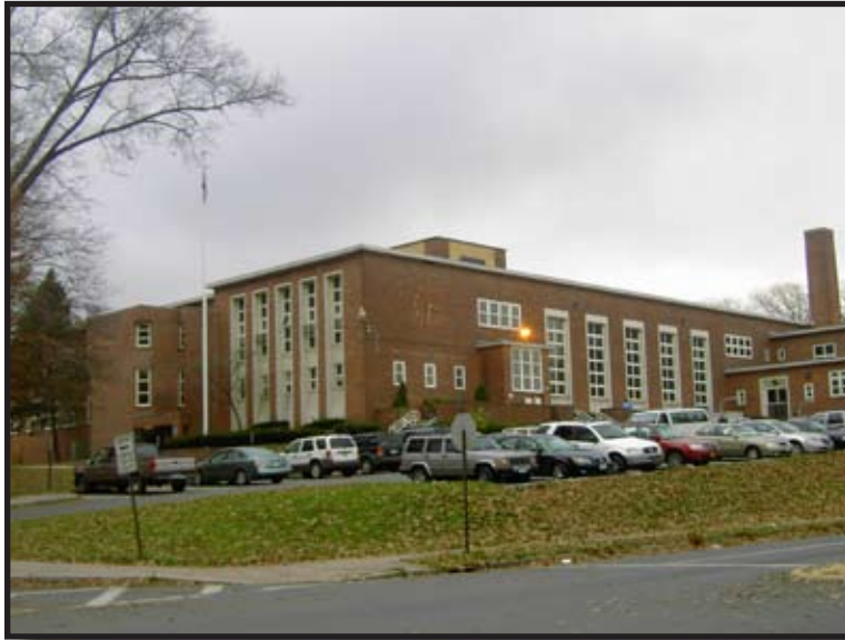
Dominick F. Burns Elementary School on Putnam Street

Police Athletic League operates a recreation program at Burns School for elementary students only. Outside the Target Area, Classical Magnet, Belizzi Magnet, Pathways to Technology, Hartford Transitional Learning Academy, and Hartford High each have after school programs that serve students who reside in the Target Area