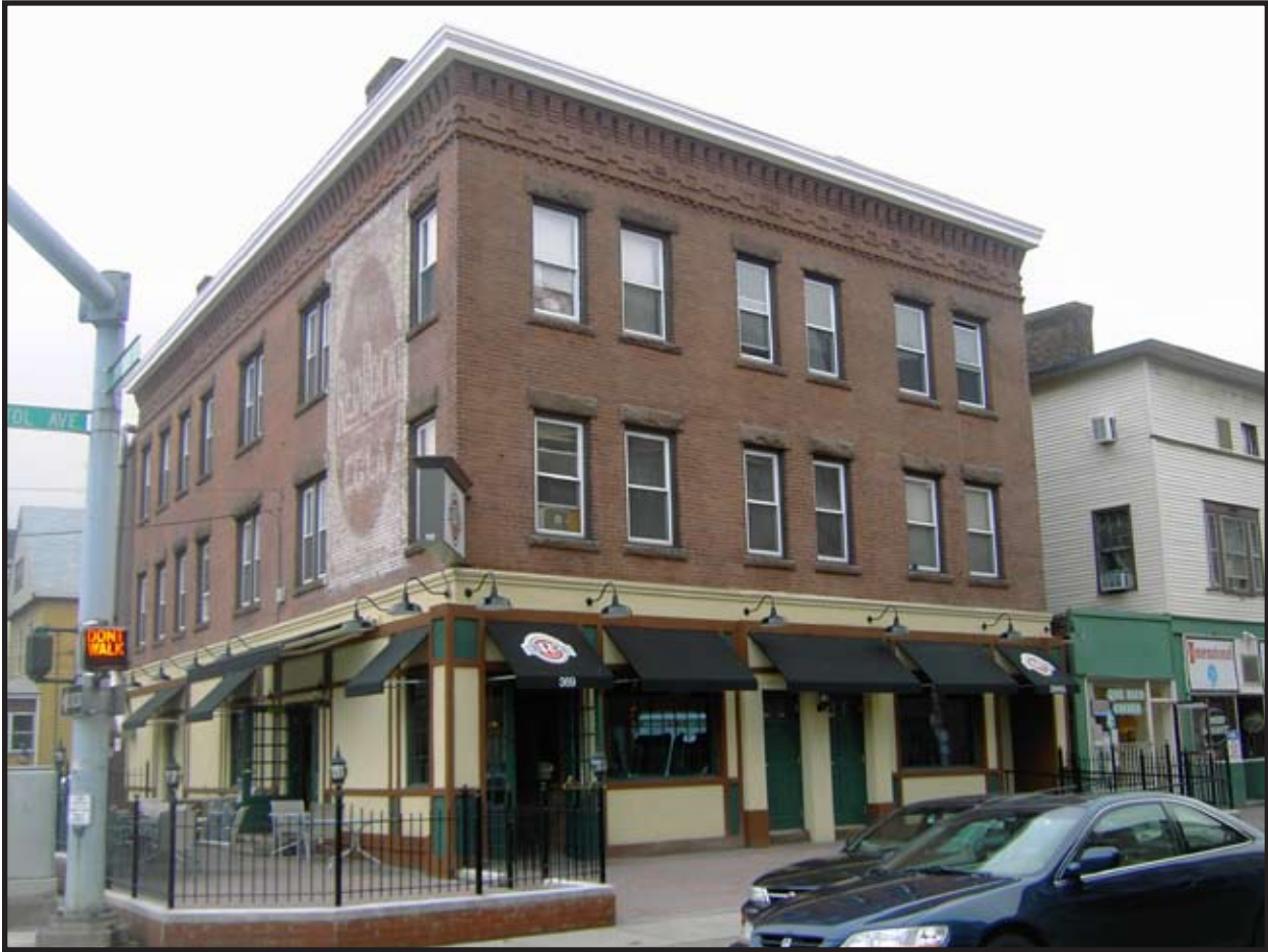
The former Kenny's Restaurant, now named the Red Rock Café