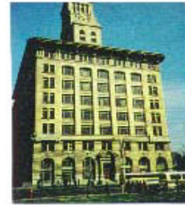
Model for new development at this site and along Main Street