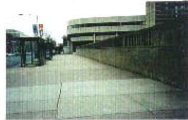
Perhaps the most desirable commercial location in the city of Hartford: across from the Wadsworth Athenaeum

The south side of the MDC building is used for parking. The wall can be retrofitted with windows, preferably large windows on the ground floor. Considering the market, facing a nationally renowned art museum and park in the center of the downtown, new uses for at least the first floor, such as retail, should be considered. Last, a one- or two-story building should be constructed, on the west side of the complex. What an opportunity for a restaurant or reception space, facing the park! The addition would serve to screen the air handling machinery space from the street; it would not obstruct residential units' view of the park. Creating more activity on the edge of the park would make it safer for any walking around the park in the evening, and for those coming into the city for events, who park along the park.