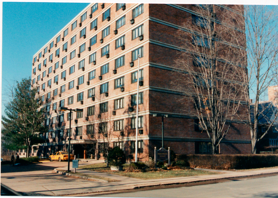
Pictured above is Immanuel House, a senior housing complex on Woodland Street.

Asylum Hill is home to about 12% of Hartford's 26,000 over 65 population. There are five (5) senior housing complexes in the Hill with approximately 920 units. They are all subsidized with tenants paying 30% of their income for rent and utilities, unless their income indicates they can pay market price. Thus all income, educational and cultural levels live together in great diversity. Presently, under remodeling is a 79 unit senior housing residence on Sumner street due to open in May 1998.