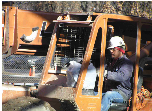
School construction means jobs!