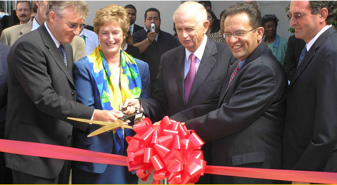
Ribbon cutting ceremony at the Marriot Hartford Downtown

First it was the new and improved Hilton Hartford. Now, the Marriott Hartford Downtown is open for business. That means in less than six months, two major hotels have opened their doors to guests visiting New England's Rising Star!